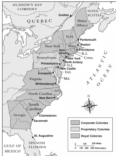
THE THIRTEEN ENGLISH COLONIES AROUND 1750

South Carolina In 1670, in the southern Carolinas, a few colonists from England and some planters from the island of Barbados founded a town named for their king. Initially, the southern economy was based on trading furs and providing food for the West Indies. By the middle of the 18th century, South Carolina's large rice-growing plantations worked by enslaved Africans resembled the economy and culture of the West Indies.