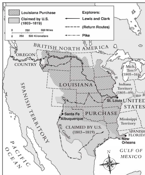
THE LOUISIANA PURCHASE, 1803

Lewis and Clark Expedition Even before Louisiana was purchased, Jefferson had persuaded Congress to fund a scientific exploration of the trans-Mississippi West to be led by Captain Meriwether Lewis and Lieutenant William Clark. The Louisiana Purchase greatly increased the importance of the expedition. Lewis and Clark set out from St. Louis in 1804, crossed the Rockies, reached the Oregon coast on the Pacific Ocean, then turned back and completed the return journey in 1806. The benefits of the expedition were many: greater geographic and scientific knowledge of the region, stronger U.S. claims to the Oregon Territory, better relations with American Indians, and more accurate maps and land routes for fur trappers and future settlers.