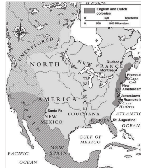
EARLY SETTLEMENTS IN NORTH AMERICA 1600s

The conquistadores sent ships loaded with gold and silver back to Spain from Mexico and Peru. They increased the gold supply by more than 500 percent, making Spain the richest and most powerful nation in Europe. Spain's success encouraged other nations to turn to the Americas in search of gold and power. After seizing the wealth of the Indian empires, the Spanish instituted an encomienda system, with the king of Spain giving grants of land and natives to individual Spaniards. These Indians had to farm or work in the mines. The fruits of their labors went to their Spanish masters, who in turn had to "care" for them. As Europeans' diseases and brutality reduced the native population, the Spanish brought enslaved people from West Africa under the asiento system. This required the Spanish to pay a tax to their king on each slave they imported to the Americas.