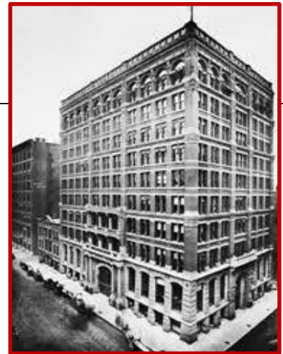
William Le Baron Jenney built the ten story Home Insurance Company building in Chicago (pictured above) which was the first true American skyscraper.