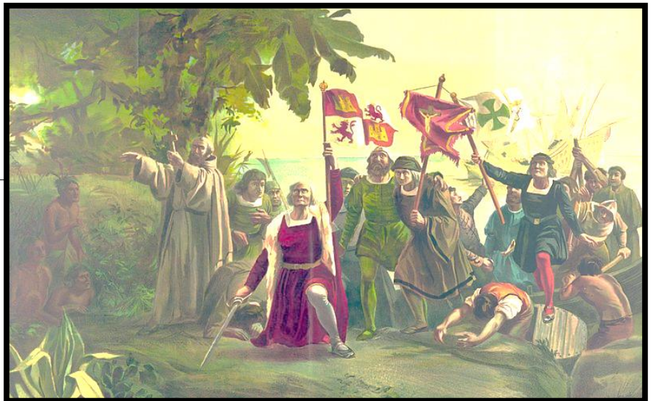
Image Source: Public Domain, Library of Congress, First landing of Columbus on the shores of the New World, at San Salvador; W.I., Oct. 12th 1492 , Dióscoro Teófilo Puebla Tolín