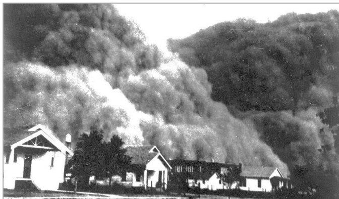
Photograph of dust cloud enveloping neighborhood, 1933

“Let the workers organize. Let the toilers assemble. Let their crystallized voice proclaim their injustices and demand their privileges. Let all thoughtful citizens sustain them, for the future of Labor is the future of America.”